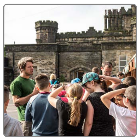
We can't wait to see you at Robinwood!