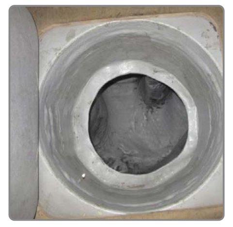
If I want to get out of the caves there are exit hatches in the roof. If I knock on it, my Group Leader will come and let me out.